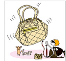
Is This It for the It Bag?