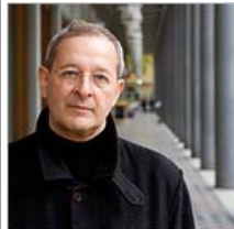
Novelist Writes of History in the Present Tense