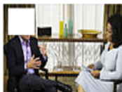
'Lance Armstrong is dead meat'