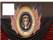
Preparations Underway for Obama's