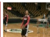
Chicago Bulls Derrick Rose shoots...