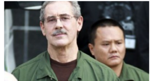
Allen Stanford

Stanford, of course, was convicted of fraud and is serving a 110-year prison sentence. Two top lieutenants have pleaded guilty, and two others were convicted by a Houston jury last week.