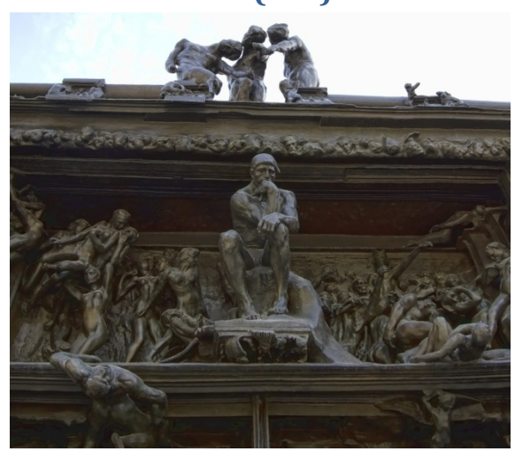
"Lasciate ogne speranza, voi ch'intrate" whom fail to heed this form.