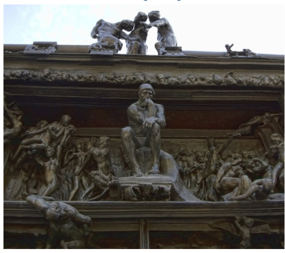
"Lasciate ogne speranza, voi ch'intrate" whom fail to heed this form.