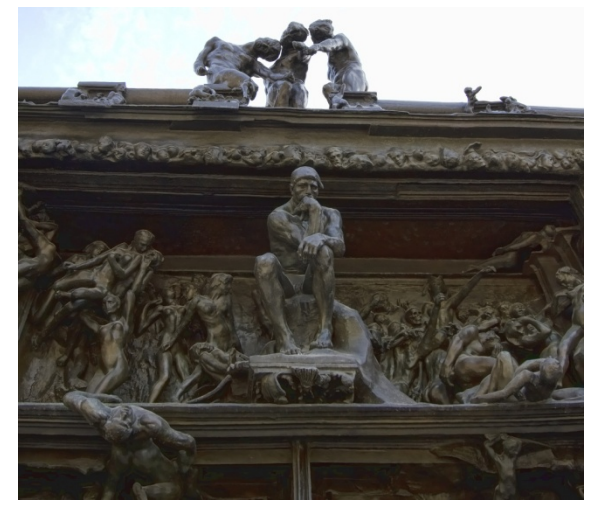
" Lasciate ogne speranza, voi ch'intrate "<sup>1</sup> whom fail to heed this form.