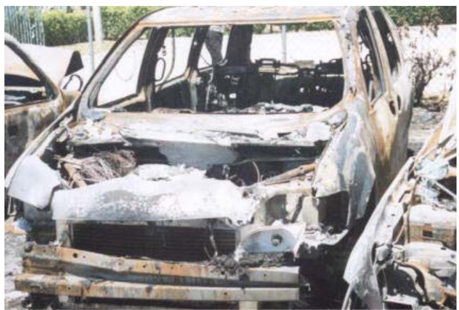
NOTE- THE CAR BOMBING IS NOT A SCENE OUT OF A WAR ZONE BUT INSTEAD TOOK PLACE IN BOYNTON BEACH FL