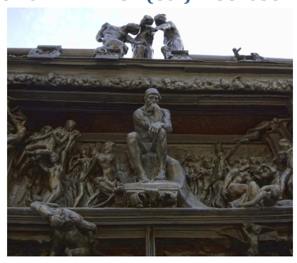
"Lasciate ogne speranza, voi ch'intrate" whom fail to heed this form.