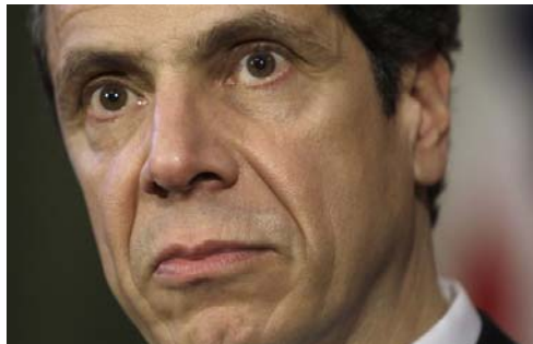
Cuomo, affirmative-action lender.

34 “Cuomo And Geithner Skated” Investor’s Business Daily, IBD Editorial http://www.investors.com/NewsAndAnalysis/Article.aspx?id=571919&p=2