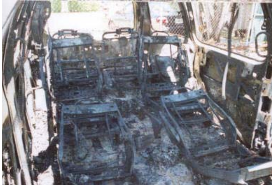
(where the kids would have been)