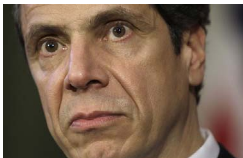
Cuomo, affirmative-action leader.

34 "Cuomo And Geithner Skated" Investor's Business Daily, IBD Editorial http://www.investors.com/NewsAndAnalysis/Article.aspx?id=571919&p=2