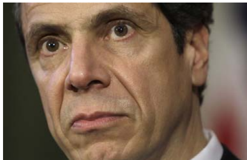
Cuomo, affirmative-action lender.

New York Attorney General and the Governor of New York are, the “sheriffs” of Wall Street, whom instead look more like criminal accomplice disguised as sheriffs and again more lawyers with interests in the controlled demolition of the markets. Further, reports 29 show overwhelmingly that regulators “failed” to regulate, appearing asleep at