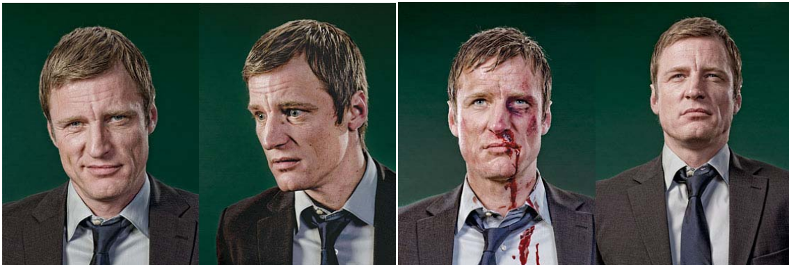
Stage 1 (left),