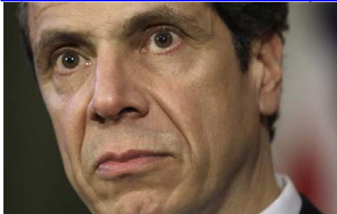
Cuomo, affirmative-action lender.