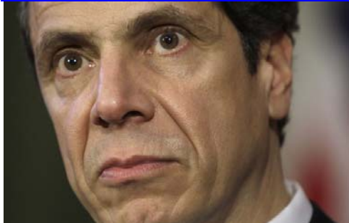
Cuomo, affirmative-action leader.

24 “Cuomo And Geithner Skated” Investor’s Business Daily, IBD Editorial http://www.investors.com/NewsAndAnalysis/Article.aspx?id=571919&p=2