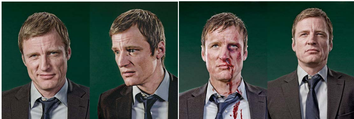
Stage 1 (left),