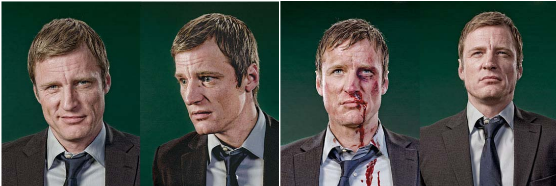
Stage 1 (left), Stage 2 (right) Stage 3 (left), Stage 4 (right)

“The Wall Street Mind: Triumphant...To the victors belong the spoils, right?” By John Heilemann Published Apr 10, 2011 New York Media LLC / New York Magazine http://nymag.com/news/business/wallstreet/john-heilemann-2011-4/