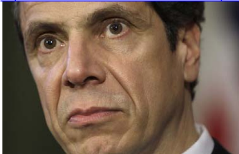
Cuomo, affirmative-action lender.

23 “Cuomo And Geithner Skated” Investor’s Business Daily, IBD Editorial http://www.investors.com/NewsAndAnalysis/Article.aspx?id=571919&p=2