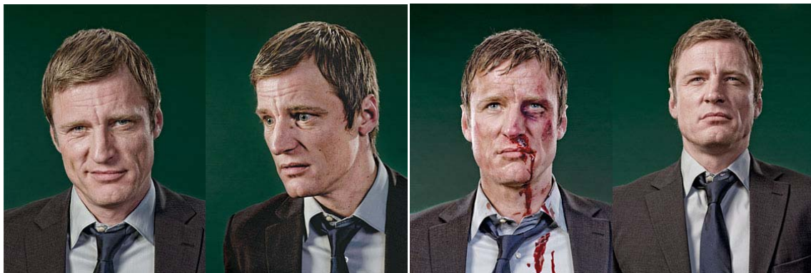
Stage 1 (left), Stage 2 (right) Stage 3 (left), Stage 4 (right)