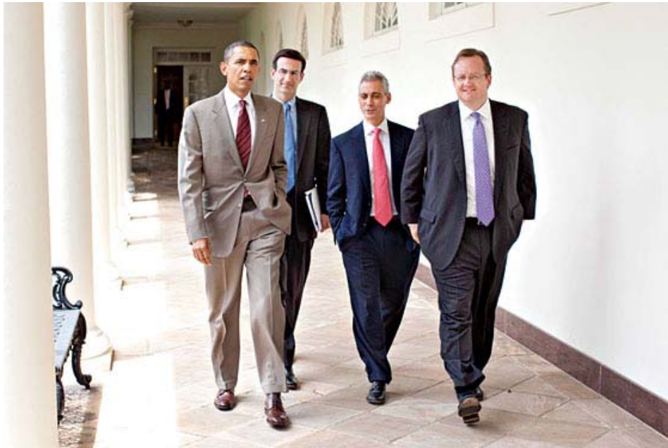
President Obama with Orszag, Rahm Emanuel, and Robert Gibbs last June.