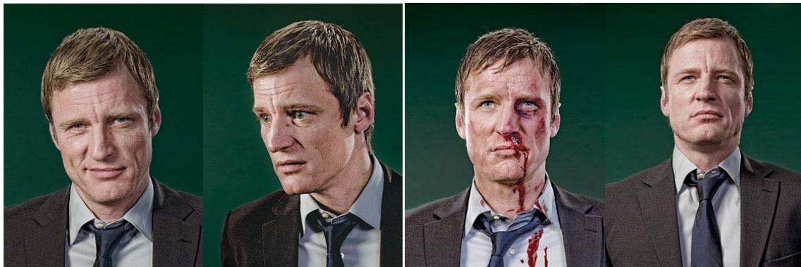
Stage 1 (left), Stage 2 (right) Stage 3 (left), Stage 4 (right)