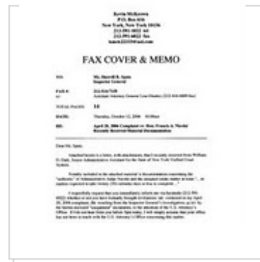
LOEHR SPATZ DAHL