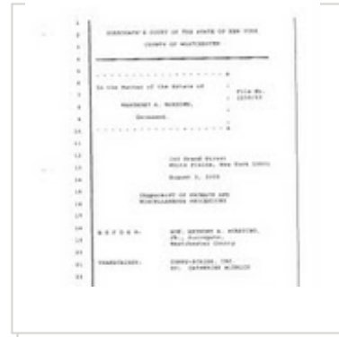
Scarpino & Streng on Internet