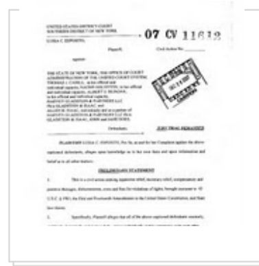
Esposito Ethics Scandal Complaint