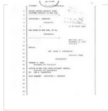
Ethics Scandal Federal Court Transcript (December 12, 2007)