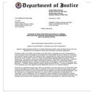
FBI Bank of New York Non-Prosecution Agreement