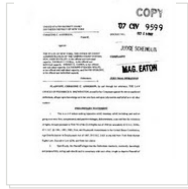
DDC Ethics Cover-Up Complaint