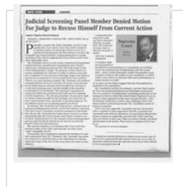
Judge Ramos Recusal: NO