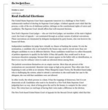
New York Times: Real Judicial Elections