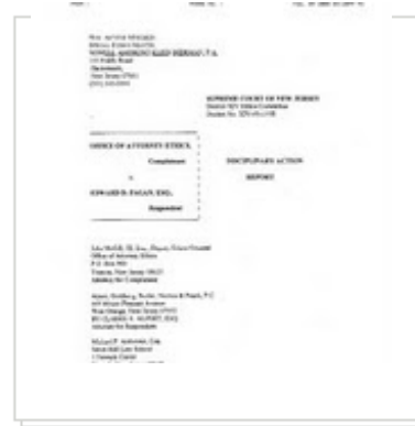
NJ Ethics Findings- Disbar Fagan