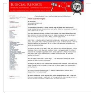
Fallen Guardian Angels