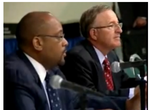
CLICK ON PHOTO TO VIEW