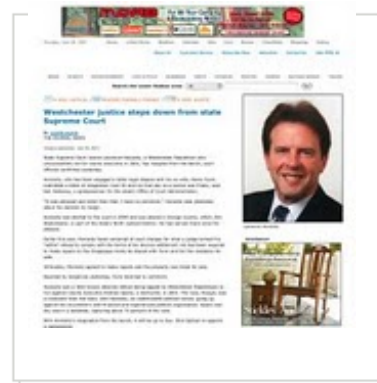
Ex-Judge Lawrence Horowitz