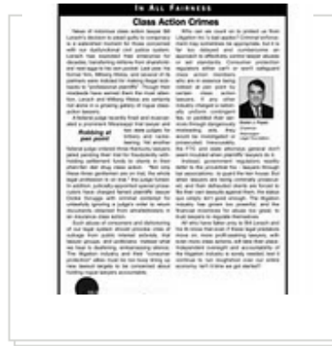
The Washington Legal Foundation

February 21, 2008 Answer by NYS - See Tuesday, February 26, 2008 POST