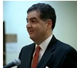
CLICK ON PHOTO OF TEMBECKJIAN TO SEE VIDEO