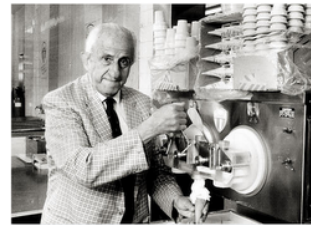
Body of Tom Carvel to be Exhumed

CLICK HERE TO SEE VIDEO OF SEPTEMBER 24, 2009 COURT CORRUPTION HEARING