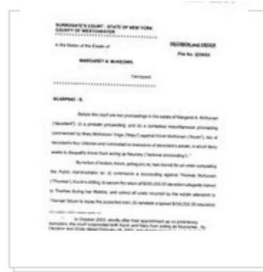
JUNE ORDERS (2)