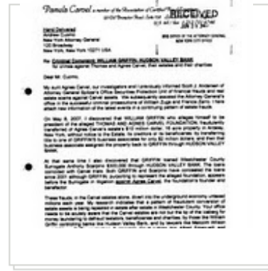
Carvel Criminal Complaint