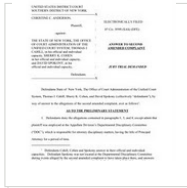
New York State's Answer in Ethics Scandal

February 21, 2008 Answer by NYS - See Tuesday, February 26, 2008 POST