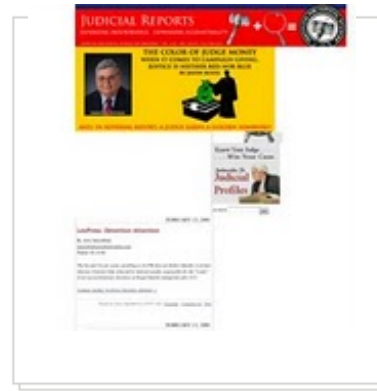
JudicialReports.com - The Color of Judge Money