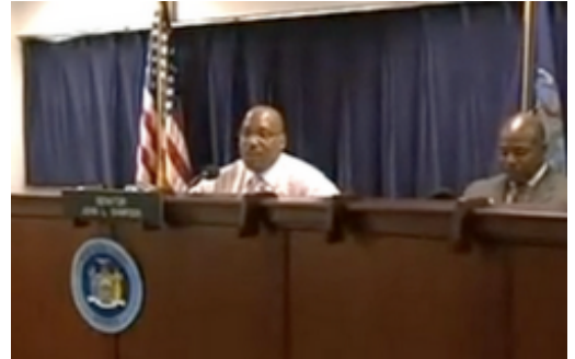
More Exposure of Widespread Corruption in NY's Judiciary