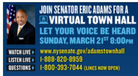
NYS Senator Adams Virtual Town Hall Tonight !