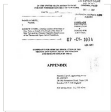
Carvel Smoking Gun