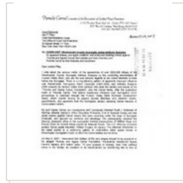
Scarpino Complaint to Judge Pfau