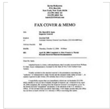
LOEHR SPATZ DAHL