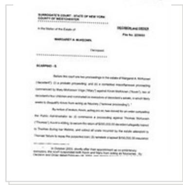
JUNE ORDERS (2)