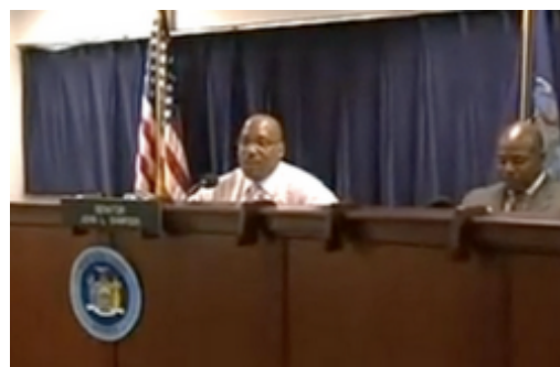
More Exposure of Widespread Corruption in NY's Judiciary