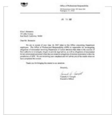
D.O.J. Widens Patentgate Probe