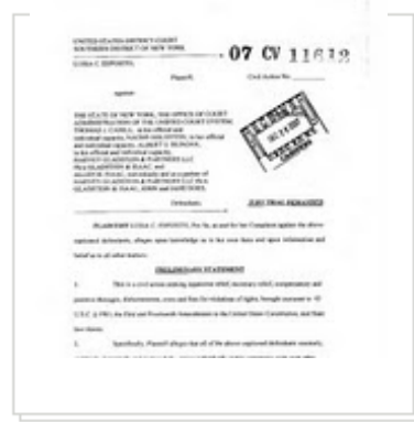
Esposito Ethics Scandal Complaint