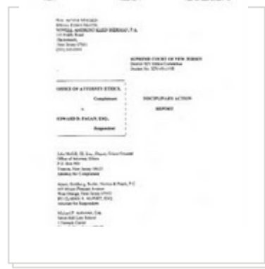
NJ Ethics Findings- Disbar Fagan