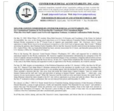
Center For Judicial Accountability, Inc. (www.judgewatch.org)