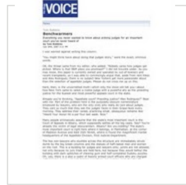
Tom Robbins on NY Judges - See July 28, 2007 Post