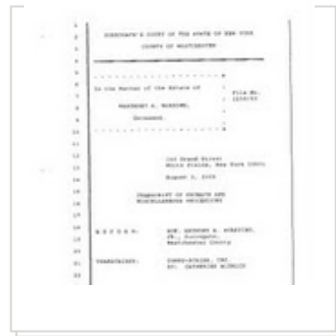
Scarpino & Streng on Internet