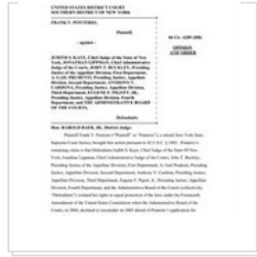
Judge Frank V. Ponterio