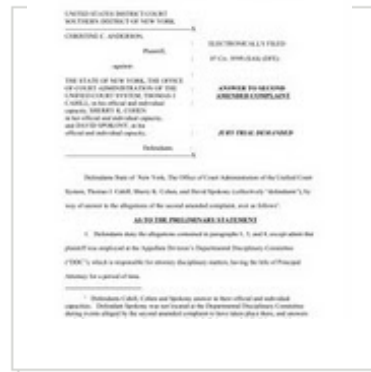
New York State's Answer in Ethics Scandal

February 21, 2008 Answer by NYS - See Tuesday, February 26, 2008 POST