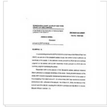
Judge to Cancer Patient: No $ for Treatment