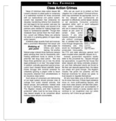
The Washington Legal Foundation

February 21, 2008 Answer by NYS - See Tuesday, February 26, 2008 POST