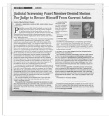
Judge Ramos Recusal: NO