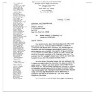
Sealing the Truth

Concealing the Truth - See Saturday, October 6, 2007 Post