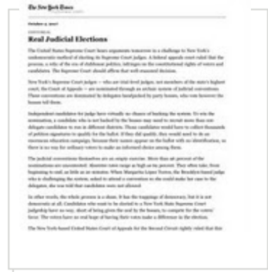
New York Times: Real Judicial Elections