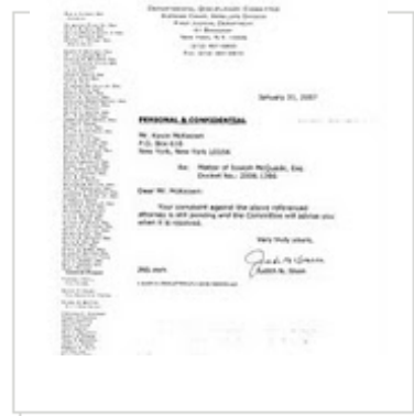
MCQUADE COMPLAINT STATUS