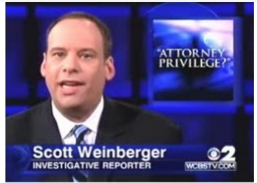
Lawyer Caught on Tape-CLICK ON IMAGE