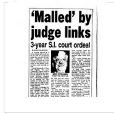
Mailed by Judge