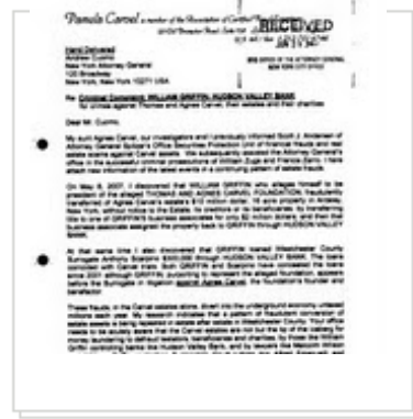
Carvel Criminal Complaint