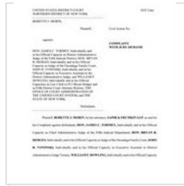
Former Chief Court Clerk Sues Judges