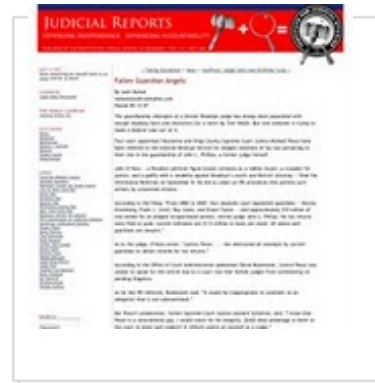
Fallen Guardian Angels