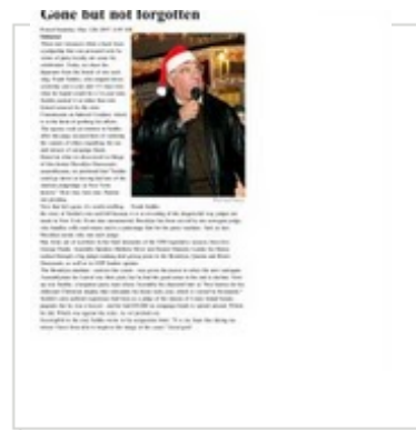
NY Daily News on Court Corruption - See May 17, 2007 Post