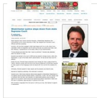
Ex-Judge Lawrence Horowitz