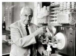
Body of Tom Carvel to be Exhumed

CLICK HERE TO SEE VIDEO OF SEPTEMBER 24, 2009 COURT CORRUPTION HEARING