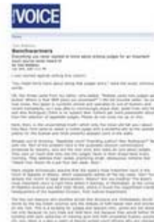
Tom Robbins on NY Judges - See July 28, 2007 Post