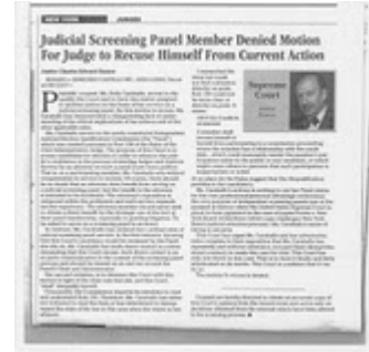
Judge Ramos Recusal: NO