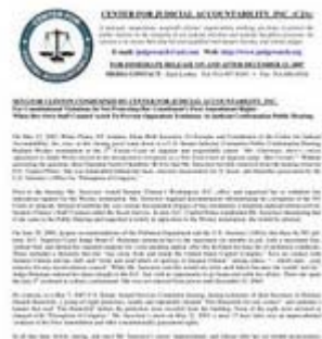
Center For Judicial Accountability, Inc. (www.judgwatch.org)