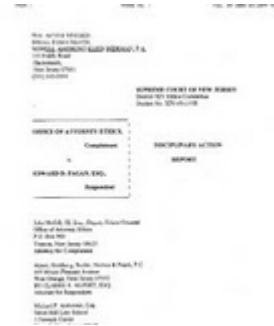
NJ Ethics Findings- Disbar Fagan