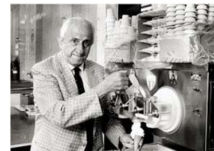
Body of Tom Carvel to be Exhumed