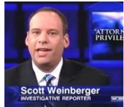
Lawyer Caught on Tape-CLICK ON IMAGE