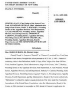
Judge Frank V. Ponterio