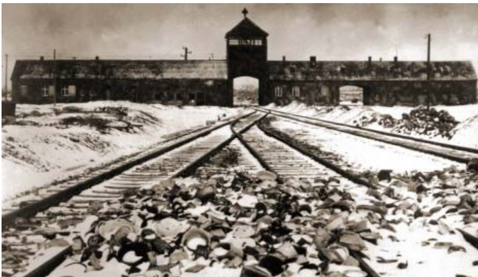
Death camp: Auschwitz, where tens of thousands of slave labourers died working in a factory run by German firm I. G. Farben